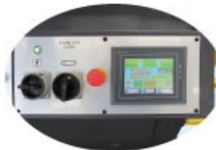
► PLC control