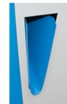
Steel chip slide down