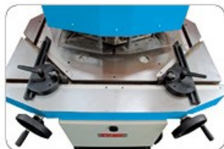
Adjust angle by handwheels