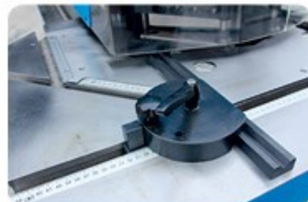
Angle gauge device