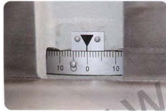
Bow swivel angle ruler