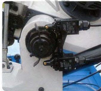
Bow position limit switch