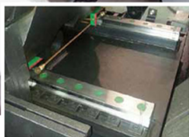
The saw head is ball screw actuated with premium grade linear guide ways.(P-230B)