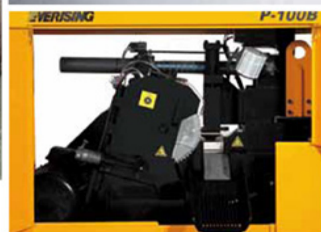
Servo controlled head stock with 30 kW (P-230B) motorized saw blade.