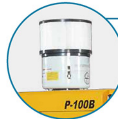
Air Filter (Opt.)