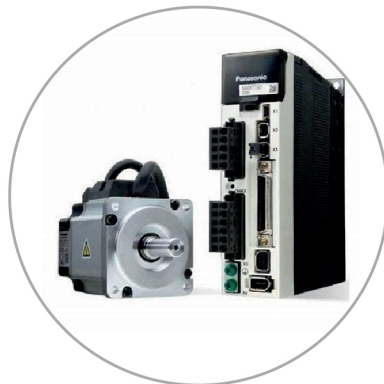
Panasonic Servo Drives