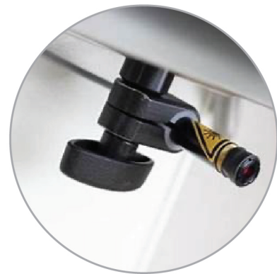
Laser alignment pointer

QLD - 07 3279 3344 | NSW - 02 8801 3375 | leads@completemachinetools.com.au | www.completemachinetools.com.au