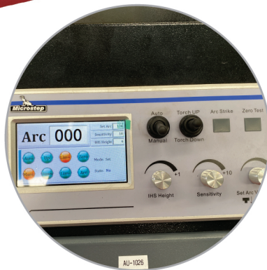
Auto Torch Height Control